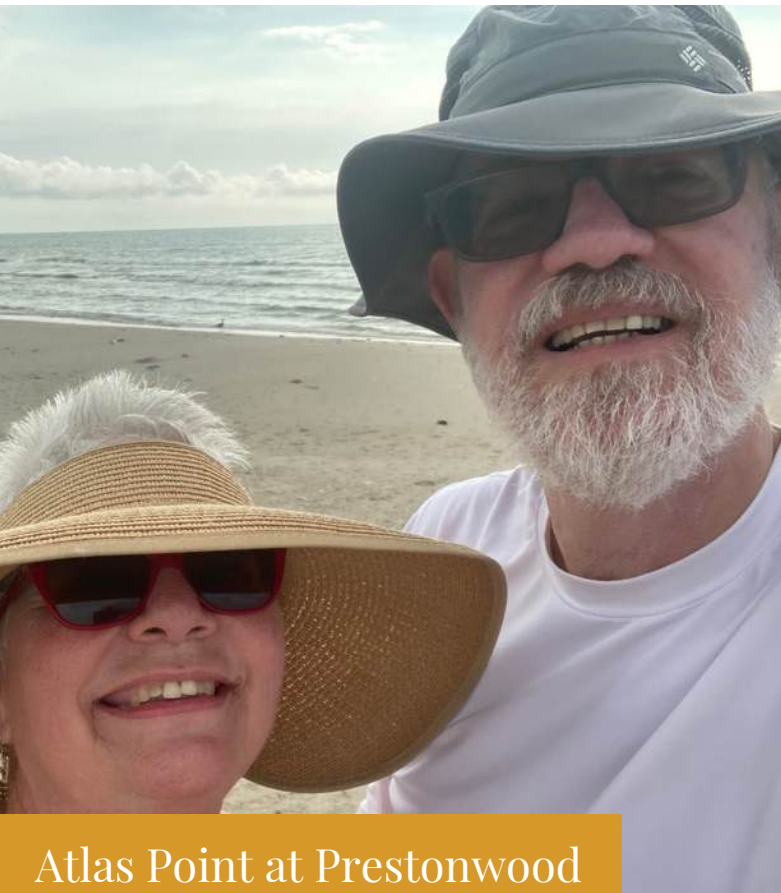
Atlas Point at Prestonwood