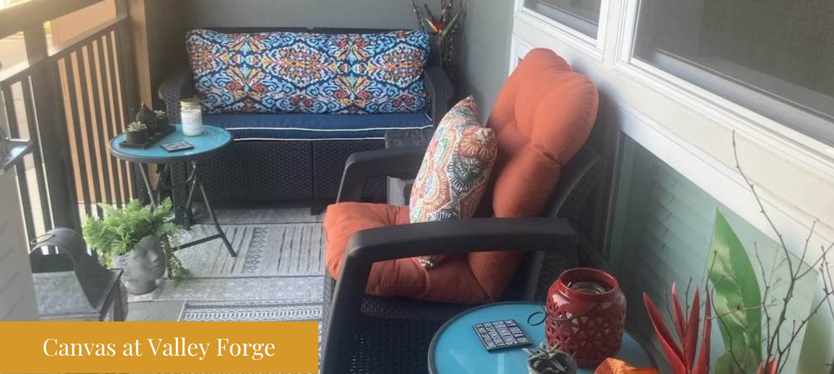
Canvas at Valley Forge